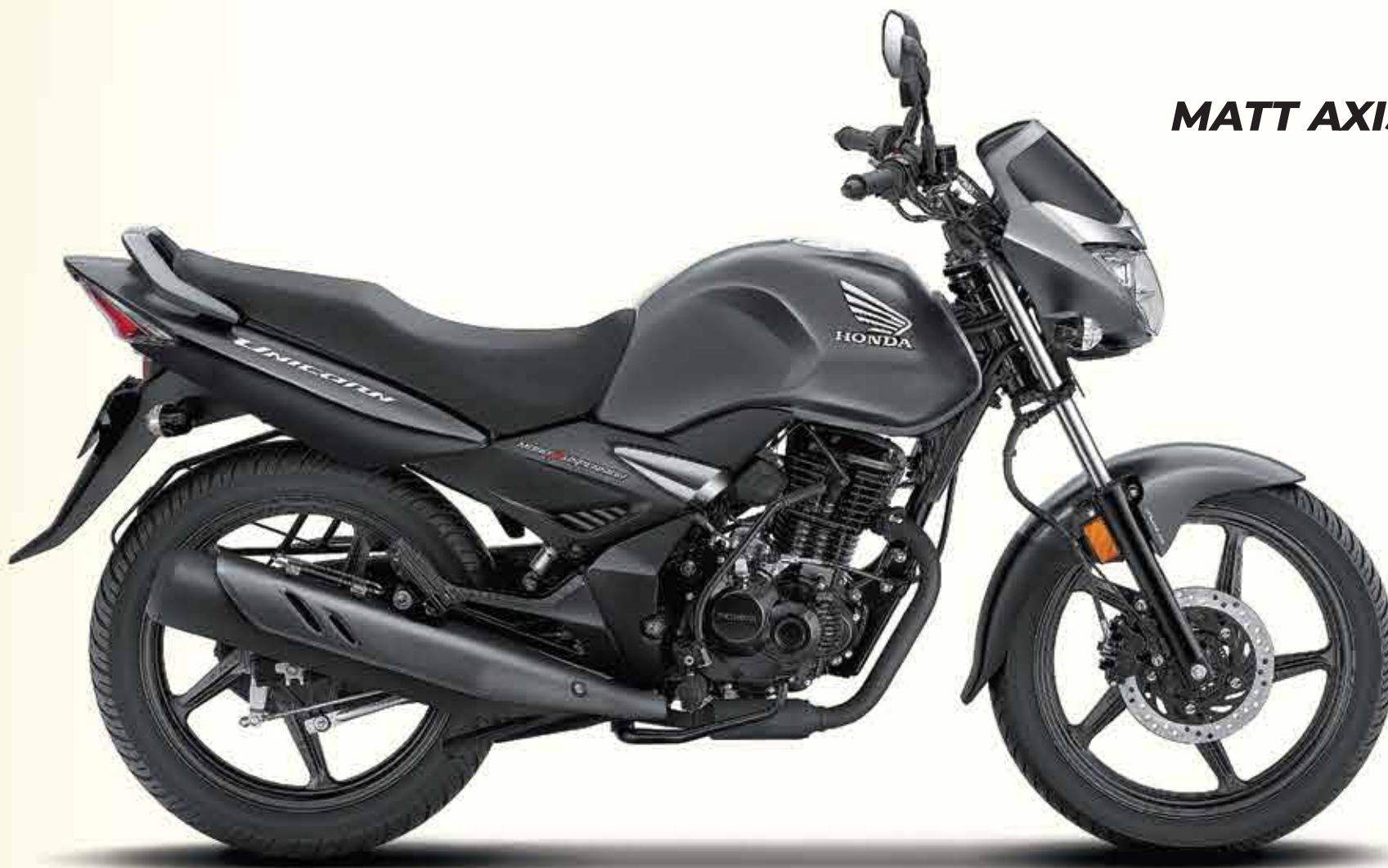
MATT AXIS GREY METALLIC